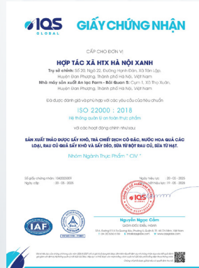
ISO 22000 : 2018