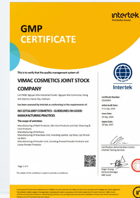
ISO 2271:2207 COSMETIC