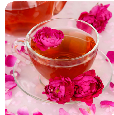
Herbal tea production