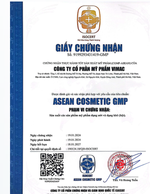
ASEAN COSMETIC GMP