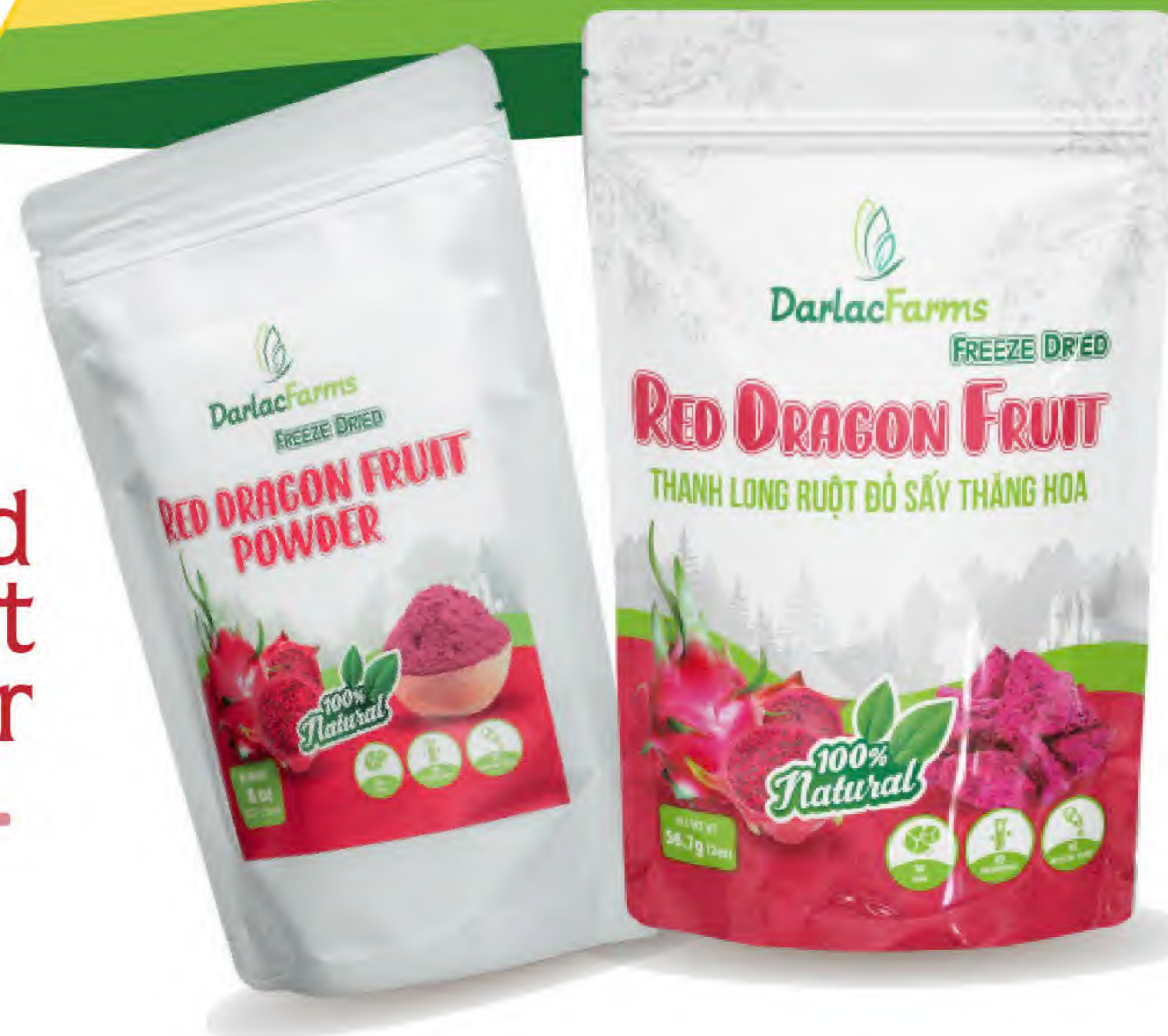
Freeze Dried Red Dragon Fruit