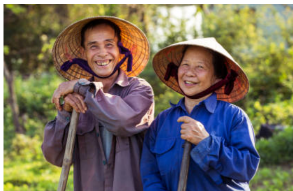
* Vietnamese farmers on black pepper farm

With modern facilities and strict inventory control, A&T guarantees product integrity and reliable supply for global customers.