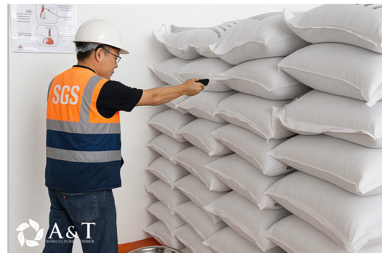
* SGS officers are inspecting a shipment for export to Russia

We successfully imported 176,000 tons of raw cashew nuts from the Government of Tanzania, supplying trusted processing and trading partners across Vietnam.