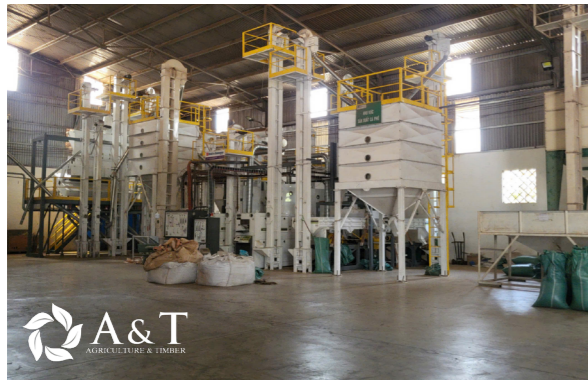
*Our partner's coffee factory is inspected by us every month