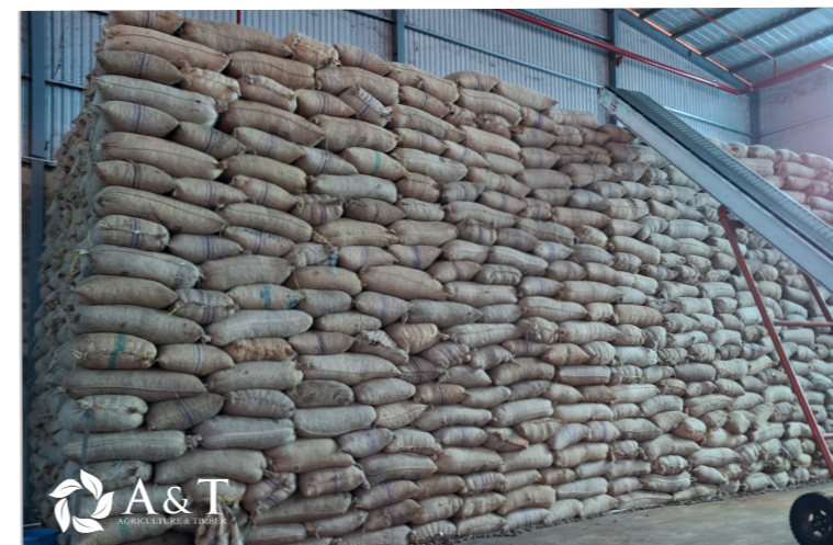
*Cashew nuts are stored in the warehouse in preparation for export