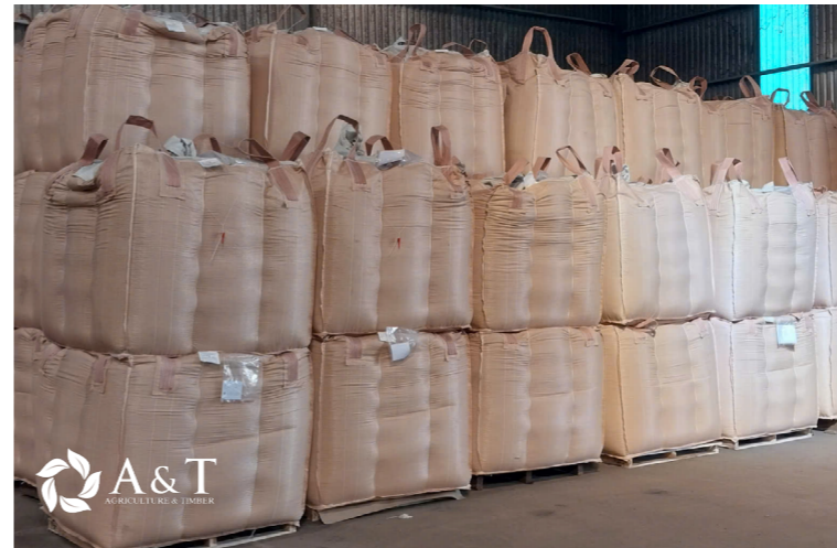
*Green coffee beans are packed for export