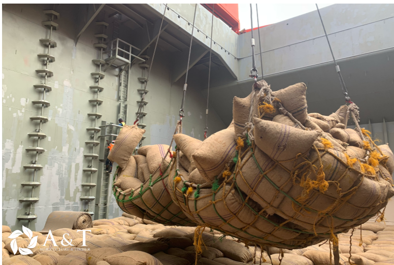
* A&T imported cashew nuts from the Government of Tanzania