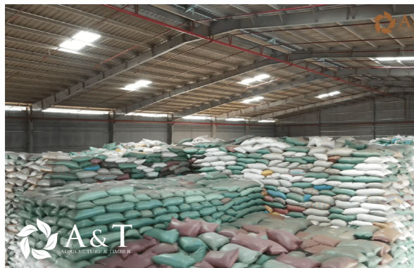
*A&T's black pepper warehouse

With experienced factory partner's, we maintain product quality and readiness for both domestic and export needs.