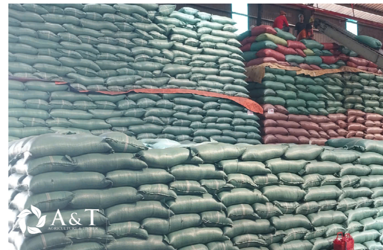
*Black pepper is stored in the warehouse in preparation for export