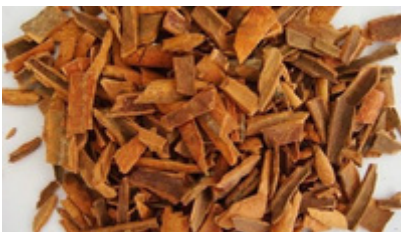
CRUSHED CINNAMON CHIPS