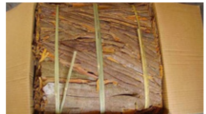
PRESSED CINNAMON TUBES