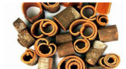
CUT CINNAMON ROLLS