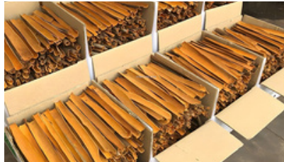
SPLIT CINNAMON STICKS