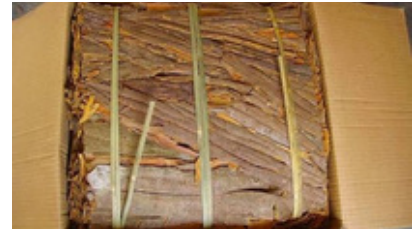
PRESSED CINNAMON TUBES